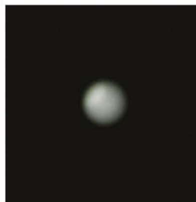
▲ Uranus, stacked from 908 frames captured with a 610nm infrared filter