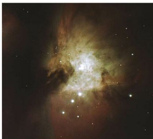
▲ The core of the Orion Nebula, showing the Trapezium Cluster, stacked from 350 two-second exposures